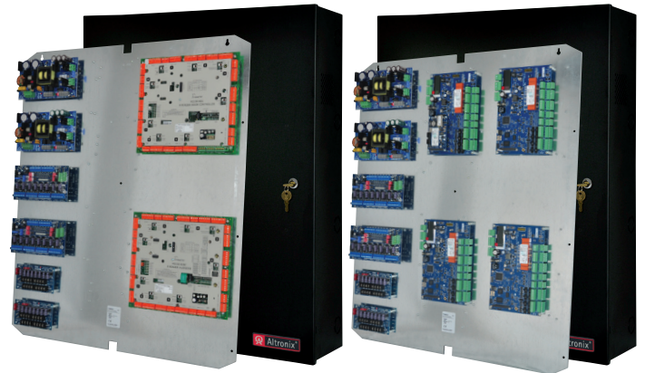
Trove3AM3 with M2150 seires boards